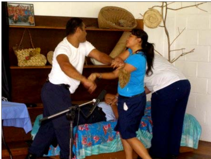
The Police skit - disturbingly real...